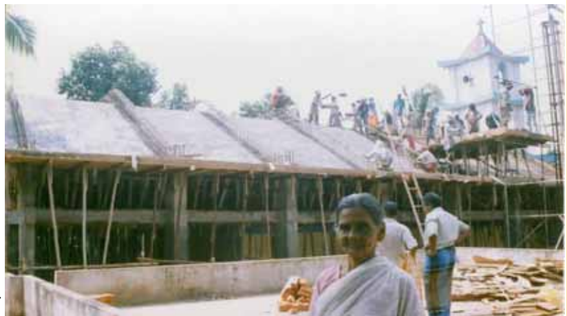
One of many chapels being rebuilt in India to accommodate the rapid expansion of congregations there