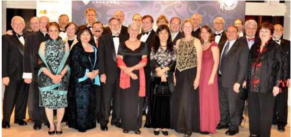
CISS founding faculty and supporters

Faculty and friends gathered again midday on Sunday, April 26, at CISS for a potluck brunch. The brunch was a great chance for old friends to catch up in an informal setting, and many were still in