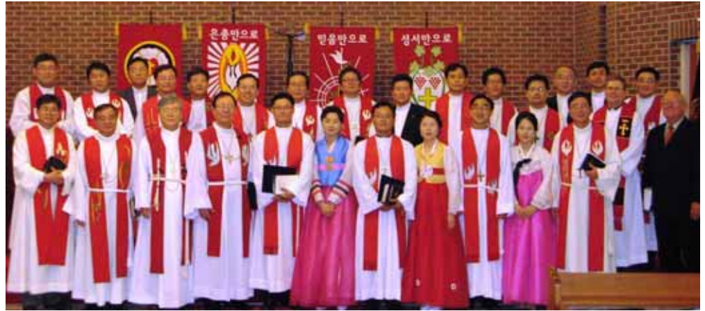
Ordination of new Lutheran pastors

The 2009 Korea Pastoral Leadership Institute (PLI) Conference and PLI Graduation took place from May 26-29, with 18 pastors and 13 spouses graduating. PLI, a non-profit organization founded for the improvement of pastoral leadership, is comprised primarily of LCMS pastors and their spouses, but is also now equipping pastors internationally. In 2001, the American PLI and the General Assembly of the LCK began working together through annual conferences aimed at improving the pastoral leadership of LCK pastors and their spouses. At this year's conference, pastor couples that have received PLI training in the past eight years received graduation papers and certificates for their