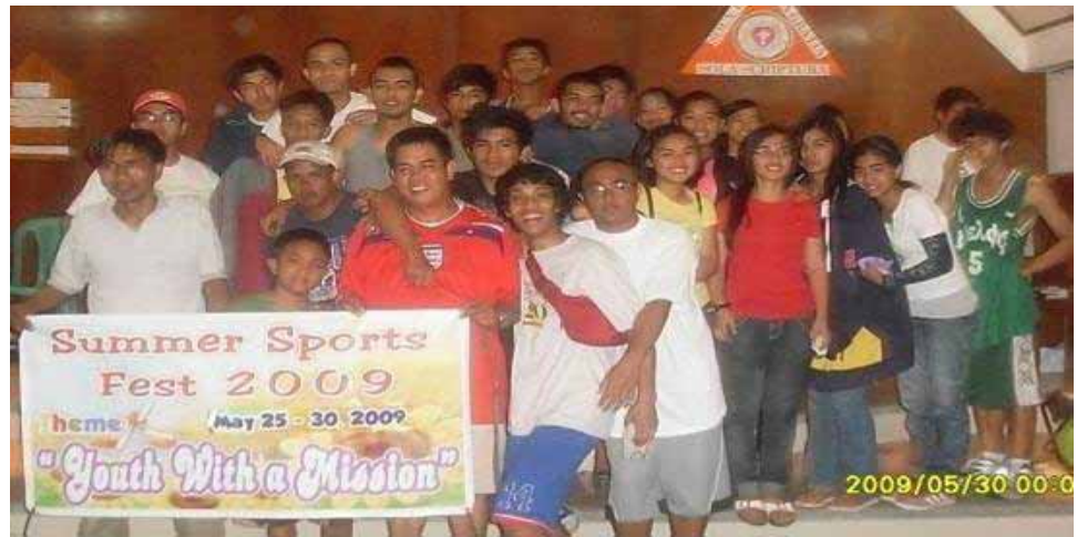
Participants in the recent Sports Fest