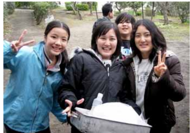
Participants at the recent NRK Youth Camp

From March 31 to April 2, the Japanese Lutheran Church (NRK) held its first Junior-Senior High Youth Camp for those in the Tokyo area, and six energetic teens were able to attend. The camp theme was "de ai" which means "an encounter." One goal was for the youth from various churches to encounter other youth, and spend time with teens who also