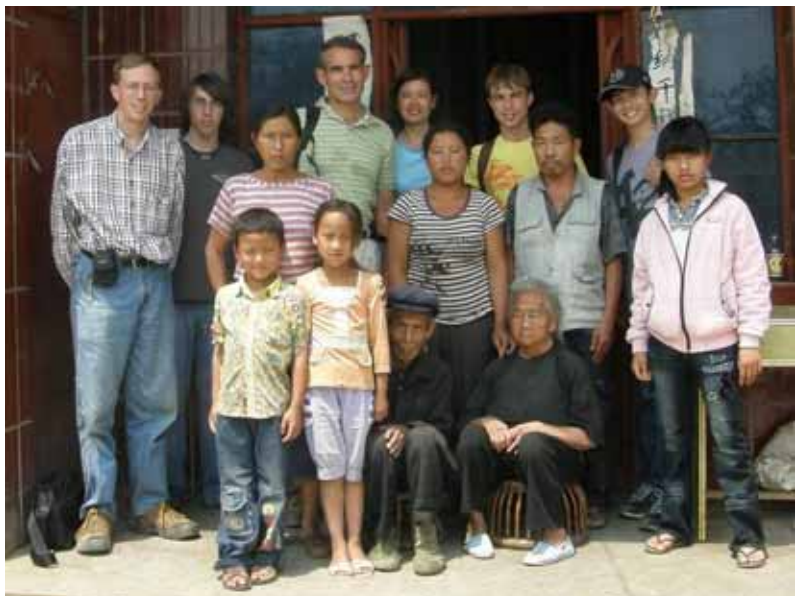
CAN team members with a village family

The service element of the trip was to help CWEF do water project follow-up in four villages where CWEF had helped to provide fresh water in the last 6 to 18 months. The team was to gather information on the impact fresh water was having on the people in the village, to understand how life was improving for them, how they were using the water, and what else should be done. They were also there to help provide additional hygiene training.