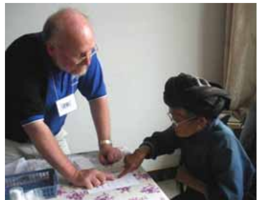
A MOST team member examines a local woman at a recent eyeglass clinic.